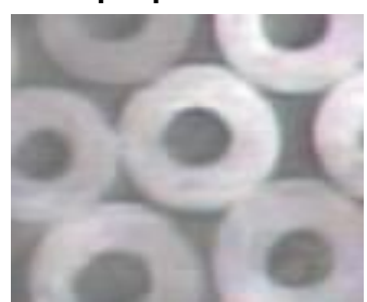
Eco-friendly polypropylene nonwoven with hollow fibers AIRYFA™