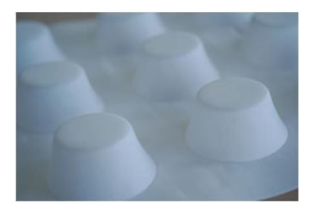
Thermoformable polyester spunbond Smash™