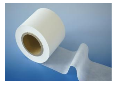
Polyester nonwoven with ultrafine fibers layered between spunbond fibers Precisé™